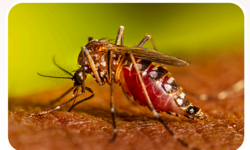
An adult mosquito bites a person.