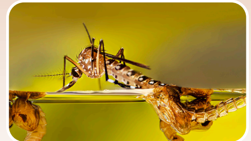
An adult mosquito emerges from a pupa.