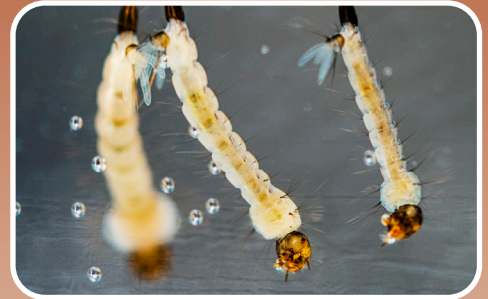
Larvae live in the water.