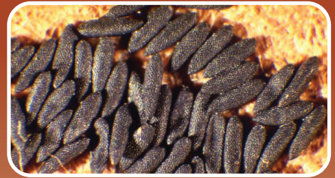
Eggs look like black dirt.